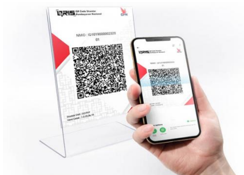
Figure 3: QRIS scanning using a smartphone

Every time you make a payment at a merchant or shop, usually the buyer will use cash, both banknotes and coins to get the desired item, then the seller will provide the item requested by the buyer according to the value of the item. Transactions like this have become a habit of Indonesian people when they want to get the goods or services they need. However, with the sophistication of technology, transactions will be much more practical using a non-cash payment system, one of which uses the Indonesian Standard Quick Response Code (QRIS) feature.