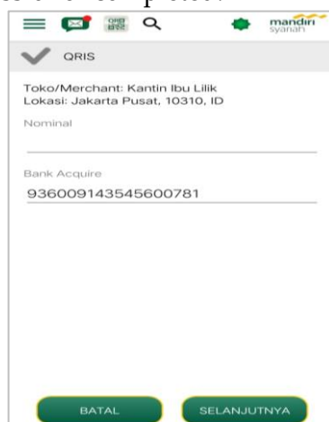
Figure 6: Payment process using QRIS

Next, you will see the name of the merchant/business and the account number of the business owner where the transaction occurs, then we are instructed to enter the nominal that will be paid to the seller. If the nominal has been filled in, the user only needs to press or touch the next button, and the transaction is complete. There will be a notification that appears on the shop owner's mobile banking application which proves the transaction has been successful or completed.