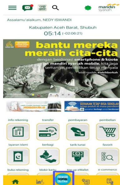
Figure 2: Shows the main screen on the Syariah Mandiri Mobile Banking application

PT. Bank Mandiri Syariah is advised to use an independent sharia mobile banking application for ease of transactions. Activities such as transfers, checking balances, paying bills (such as electricity, telephone, internet, cable TV, and water bills), purchasing vouchers, scanning barcodes and so on can be done in one application, namely Mandiri Syariah Mobile Banking. Of course, all of these features are under Islamic law because they are supervised by the Sharia Supervisory Board (DPS) which is a body formed to avoid all sharia banking risks, such as reputation risk which will give the impression of other risks such as liquidity risk and DPS also plays a role in overseeing banking activities. sharia. In the Mandiri Syariah mobile banking application, there is a new feature that allows customers to make payments simply by scanning the bar code provided by the merchant (store). Where this payment system is under the provisions of Islamic law because there are no elements prohibited by Islam such as usury or speculation. This feature is the Indonesian Standard Quick Response Code or abbreviated as QRIS. QRIS is a scanner feature owned by Bank Syariah Mandiri to support the practicality of making non-cash payments. The QRIS feature is found in the Syariah Mandiri mobile banking application which is located on the main screen at the bottom of the menu, is blue and reads QRIS. As seen in the image below: