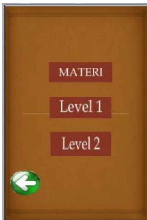
Figure 2. Main Menu