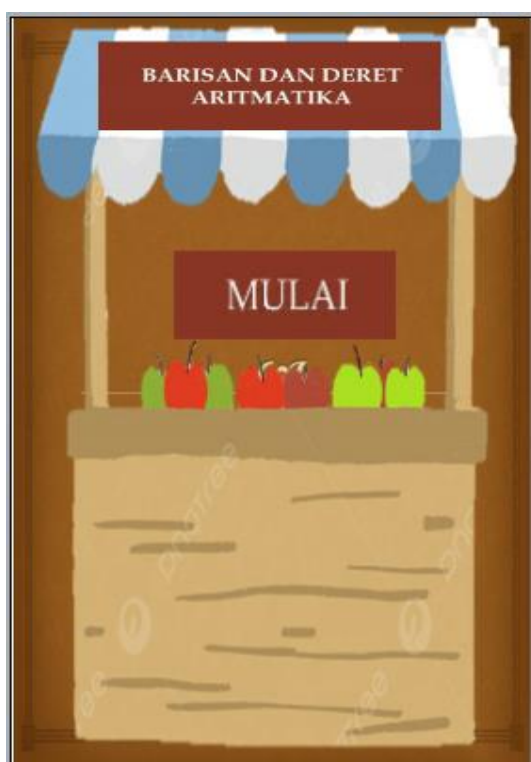
Figure 1. Intro Display

searching on the internet, this makes it easier for researchers to create designs in the form of background, buttons and things necessary for media design, also makes it easier to move each design to the page Software Construct 2. Once the design is placed on the page Software Construct 2, the researcher enters the material that has been provided in advance in the form of writing or animation in each frame in the Construct 2 application which has been downloaded. Below you will see the media display in the software.